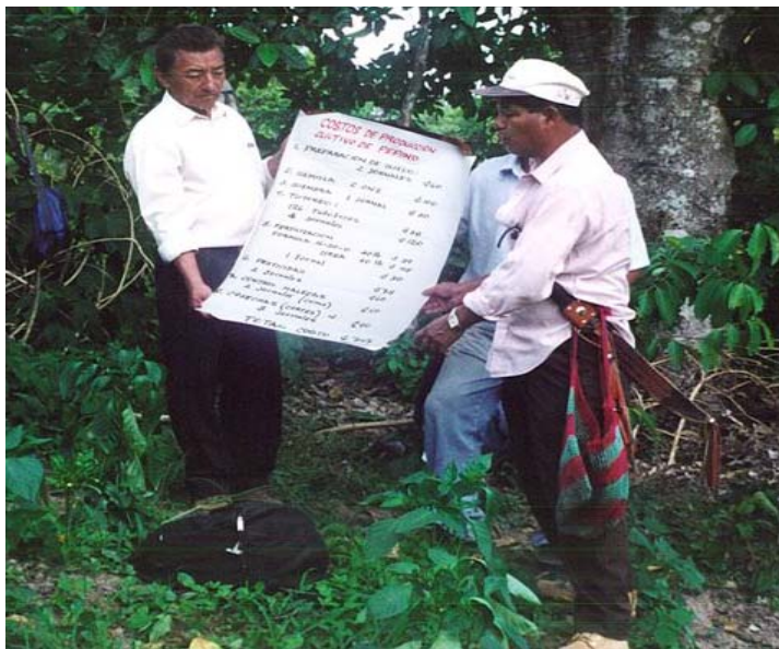
Farmers present their expected profits to extensionists from PAES.

Implement integrated systems of monitoring and impact evaluation. The projects have accumulated a great deal of farm level information that with additional analysis would greatly facilitate the task of impact evaluation. We propose to implement an integrated system to organize the data collected by the projects for use in monitoring and for different types of evaluation.